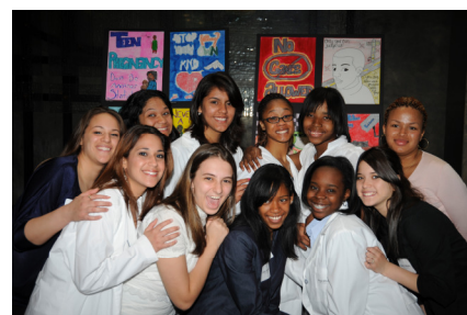
Students pose in front of their social justice projects at YWLC's Girl Power Benefit.