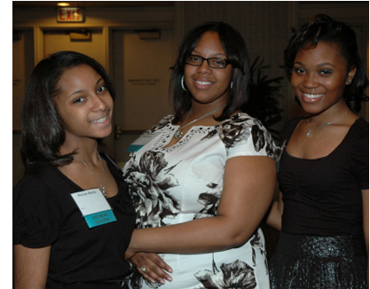
Student Speakers at YWLCs' Girl Power Benefit, held every April.