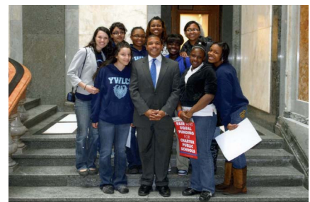
YWLCs students at Lobby Day in Springfield with then-Rep. Will Burns.