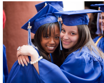
2011 YWLC Graduates celebrate their success.

2011 Date: Wednesday, October 19 8:00-11:30 am