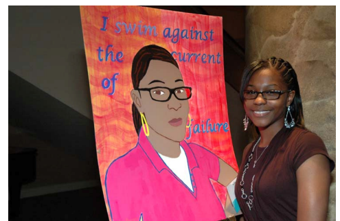
A YWLCs student poses with her self-portrait.