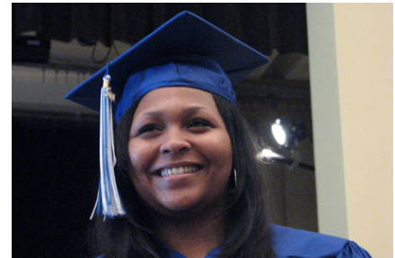
One hundred percent of the YWLCs Class of 2011 graduated. Ninety percent of the graduates were accepted into college.