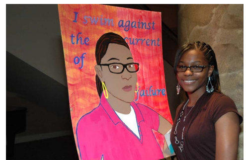
A YWLCs student poses with her self-portrait.