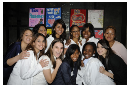
Students pose in front of their social justice projects at YWLC's Girl Power Benefit.